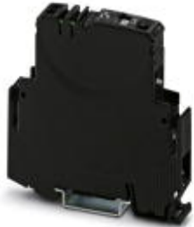
Electronic circuit breaker, signal contact: 1 N/O contact, nominal current: 1 A

Please be informed that the data shown in this PDF Document is generated from our Online Catalog. Please find the complete data in the user's documentation. Our General Terms of Use for Downloads are valid ( http://phoenixcontact.com/download )